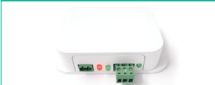
Front Panel ( 0-10VDC & serial Modbus )